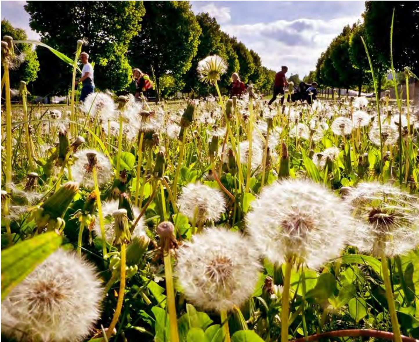
People pass by vast numbers of blossoming dandelions in a public park in Frankfurt, Germany, Thursday, May 3, 2018.

Del Toro said there is plenty of room for compromise. People can plant native flowers or allow growth only in parts of their yards. They can set up bee hotels, designed as habitats for solitary species like the leafcutter bee. And they can simply reduce their own use of pesticides, herbicides and fertilizers that can play a role in harming bee populations.